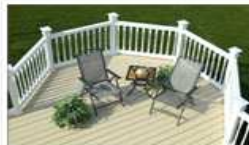
VEKAdeck: For clean, maintenance free living!

Acme is now a stocking distributor of the best decking and railing products in the world!!